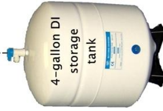
4-gallon DI storage tank