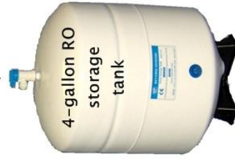
4-gallon RO storage tank