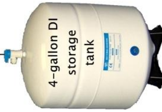
4-gallon DI storage tank