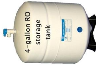
4-gallon RO storage tank